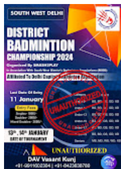
Unauthorized Tournament.jpeg 468K